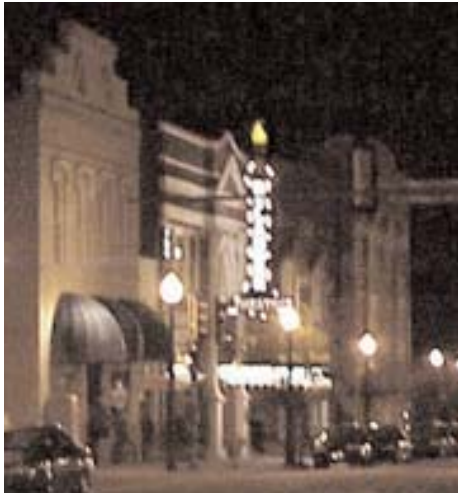
Rylander Theatre in Americus

Plains and Americus, Georgia were centrally located destinations for the participant pool. It was easily accessible by car from all directions via highway 280 and by air via the Columbus airport, located an hour's drive to the northwest.